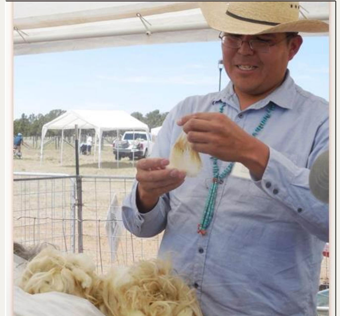
Sheep Is Life Wool Judging