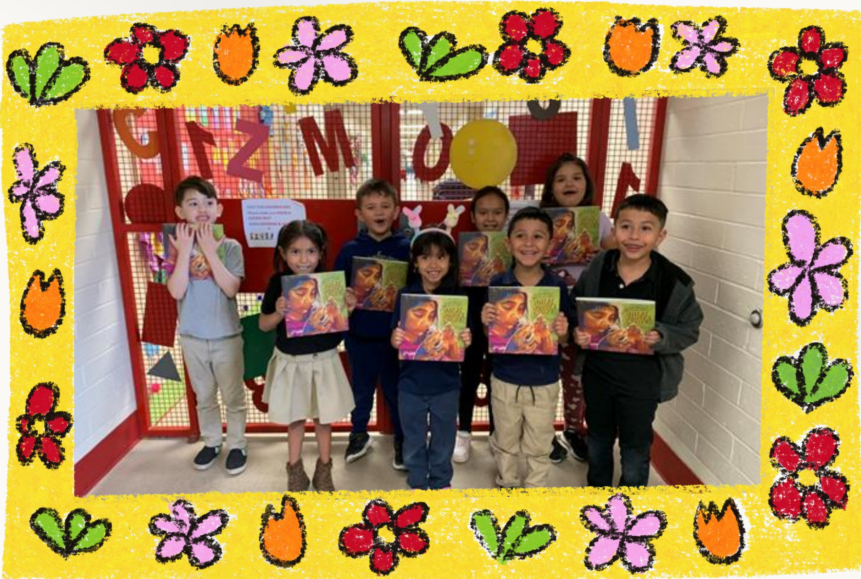
Students at Ocotillo Learning Center