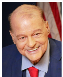
Tom Horne Superintendent of Public Instruction

Our department has allocated $1.5 million to provide the first 100,000 Arizona teachers and students with free access to Khanmigo. After that, subscriptions will be available for a modest fee. Additionally, districts and schools that sign up by February 28, 2025 , will receive access to Khanmigo for the 2025–2026 school year at no additional cost.