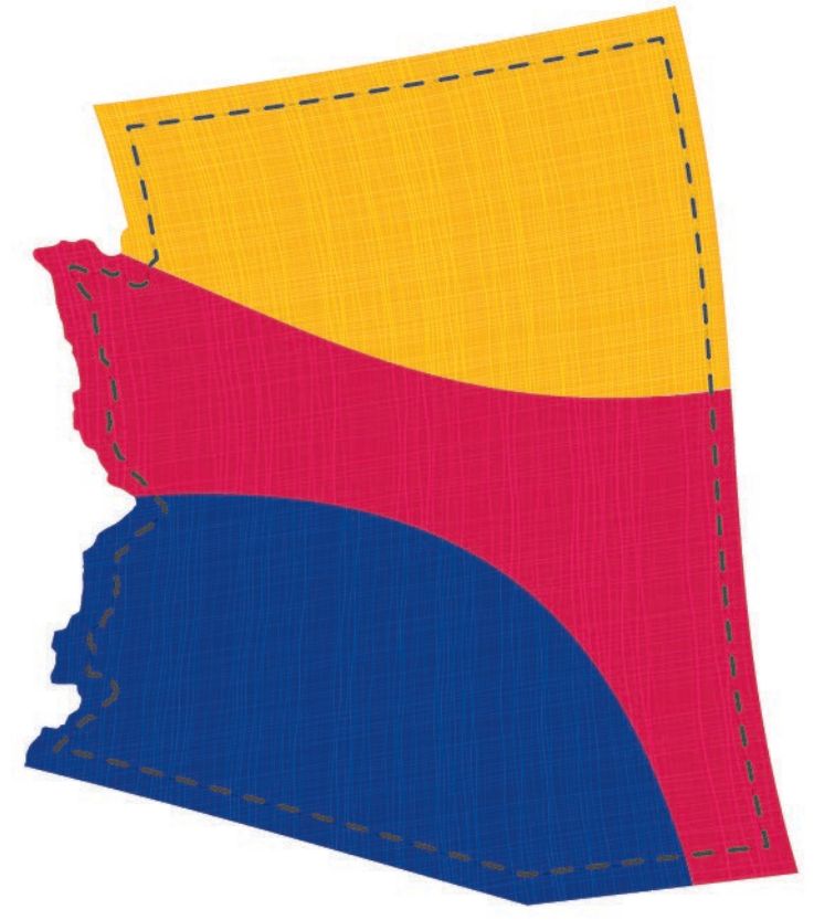
Arizona's Academic Standards Assessment